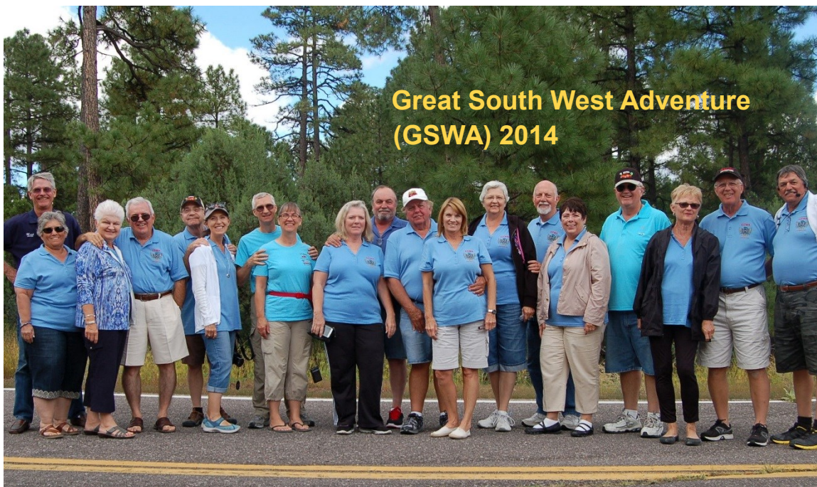
Great South West Adventure (GSA) 2014