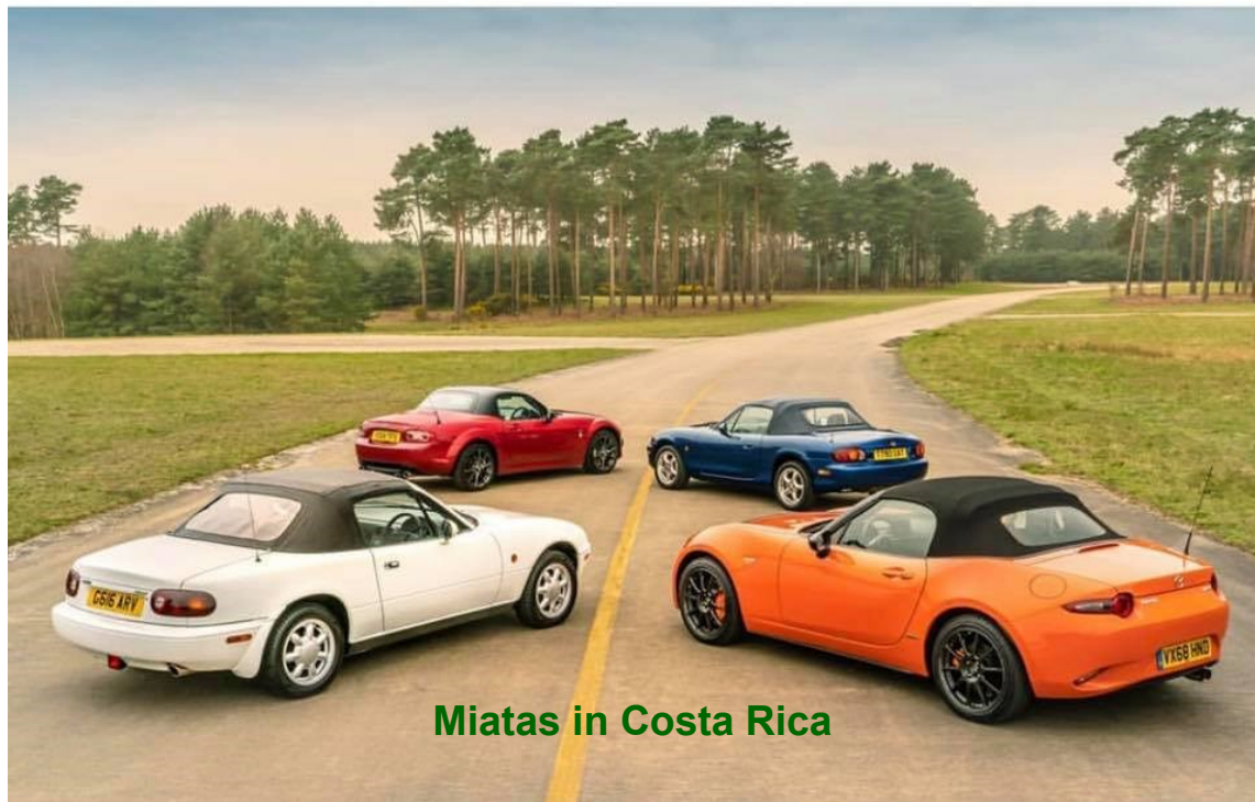
Miatas in Costa Rica